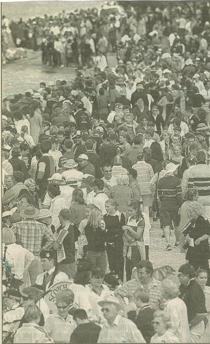
Part of the big Head of the River crowd at West Lakes yesterday